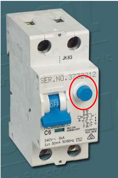
This is what an RCD in your fuse box will look like. Note the “T” or “Test” button